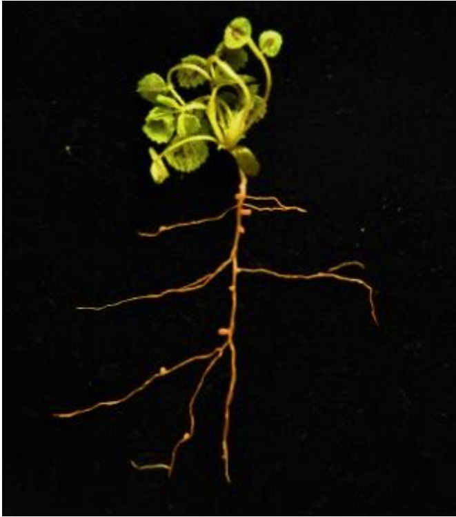
5 to 10 nodules per plant (8 in this case)