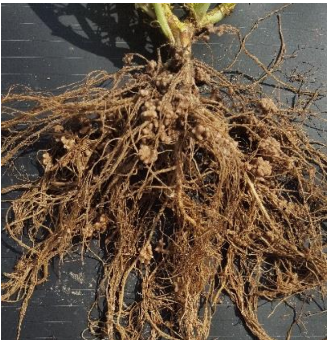
Adequate: 10 to 30 nodules; note multi-lobed nodules around crown