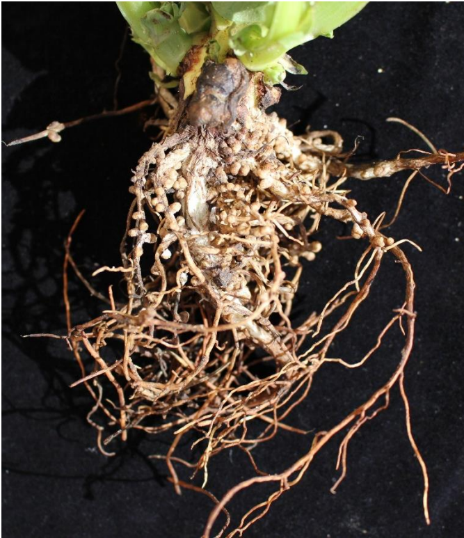
50 to 100 nodules per plant (20 nodules per plant on lighter soils)