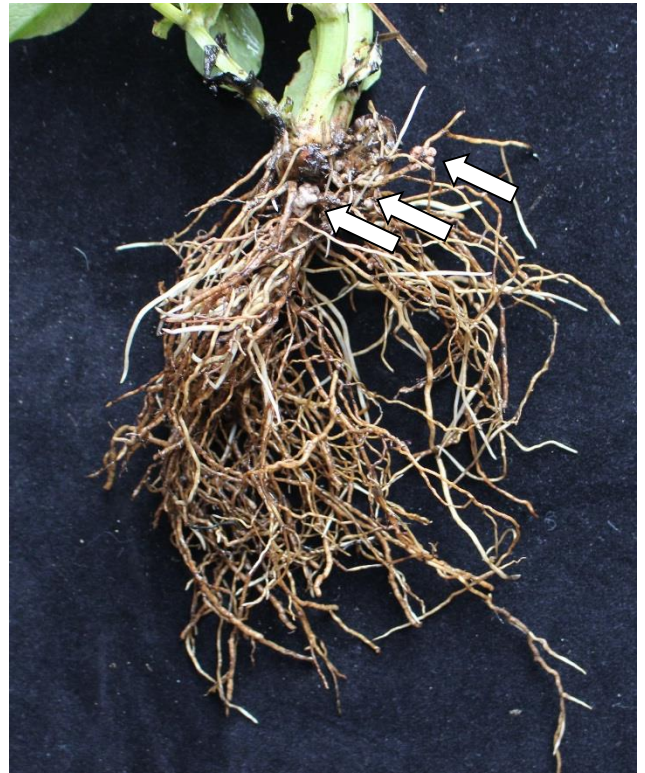
Less than 15 nodules