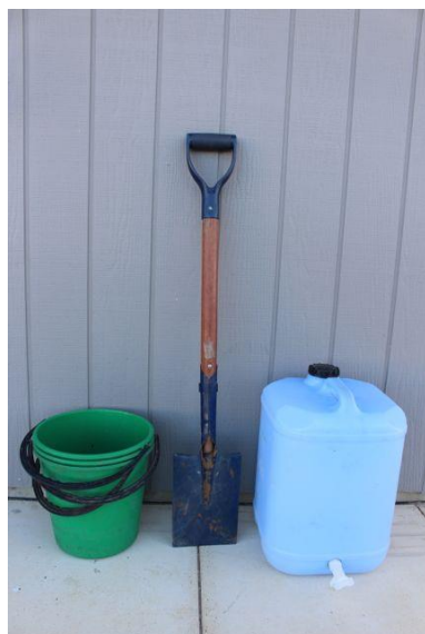
Buckets, spade, water