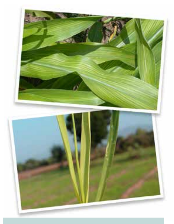
Figure 3. Photo of S deficiency in corn.

Deficiencies of S in plants can be seen visually and confirmed by plant analysis – generally younger leaves are pale green to yellow in color (Figure 3). Deficiency of S can sometimes be confused with N deficiency so it is best to confirm using tissue analysis. Plants with tissue S less than 0.12% and a N:S ratio greater than 20:1 are most likely S deficient, although critical values should be checked for your crop/stage of growth.