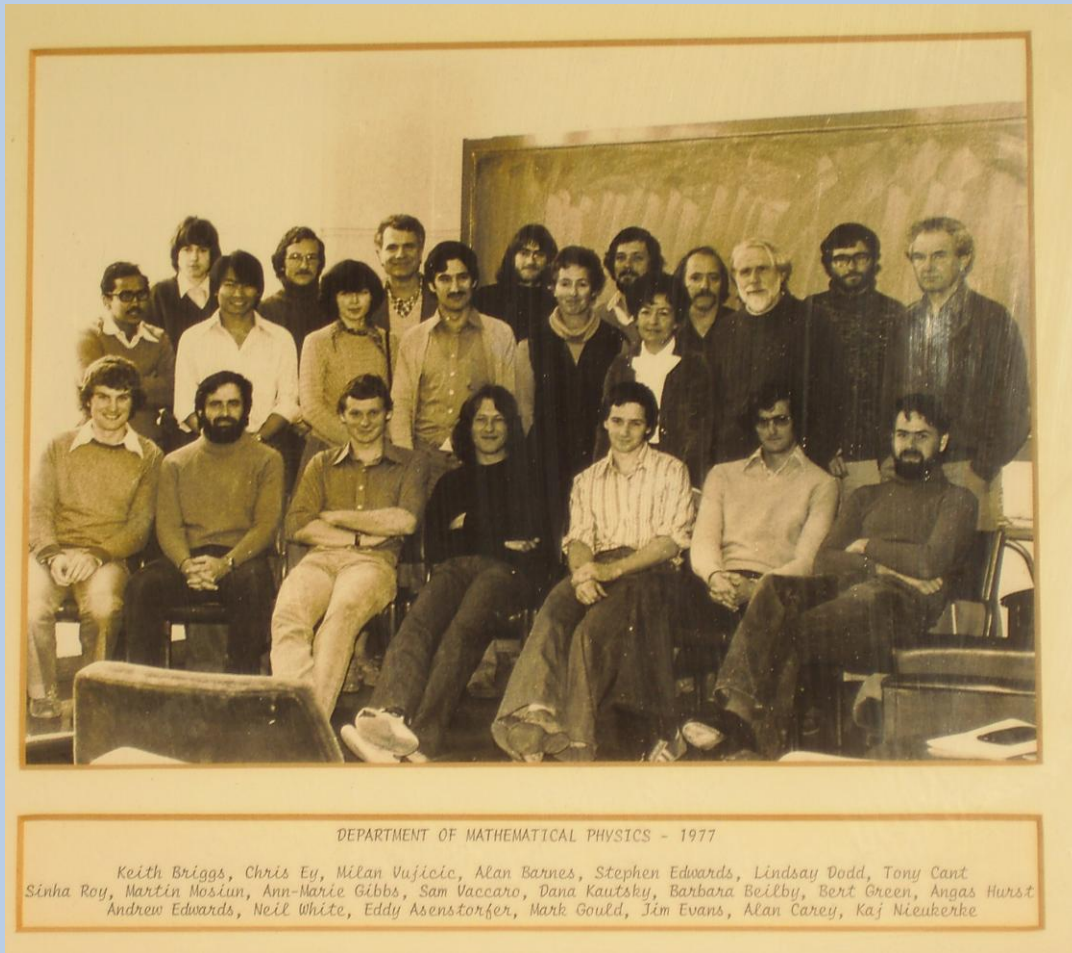
DEPARTMENT OF MATHEMATICAL PHYSICS - 1977