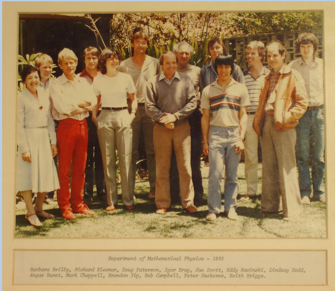
Department of Mathematical Physics - 1982