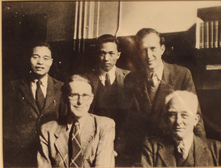
Prof Max Born with his Research Students at University of Edinburgh September 1947